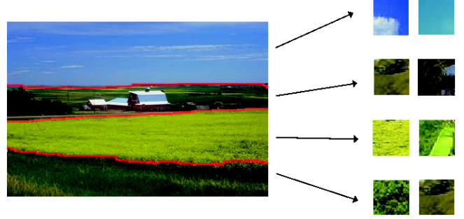
Fig. 1. A segmented image and the 2 most similar region types to each region.